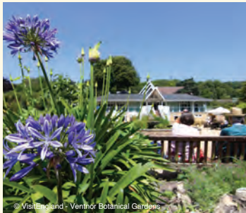
Ventnor Botanical Gardens

Monday Leaving Sandown after breakfast we board the ferry to the mainland and journey homeward.